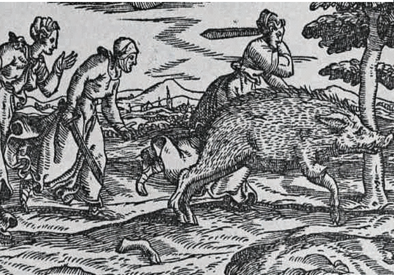
Bacchantes hunting the wild boar (Pentheus)- Ludovico Dolce -1558