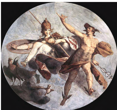
created by Donald Connor