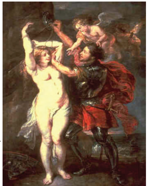
Perseus frees Andromeda - Peter Paul Rubens, 1640