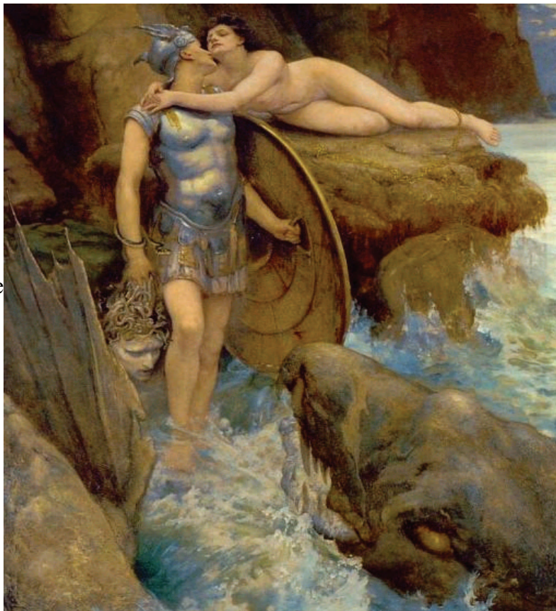
Perseus and Andromeda - Charles Napier, 1890

Andromeda - Annibale Carracci, 1560-1609