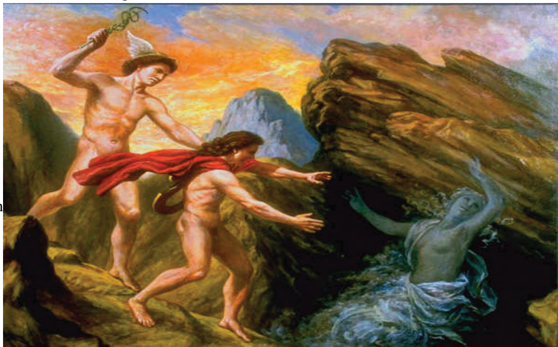
Orpheus and Eurydice - Elsie Russel, 1994 created by Donald Connor