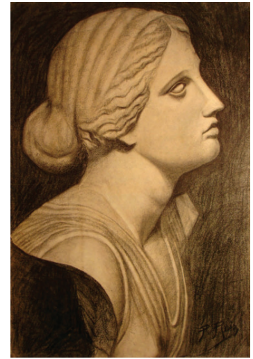
Niobid - Pablo Picasso 1894-5