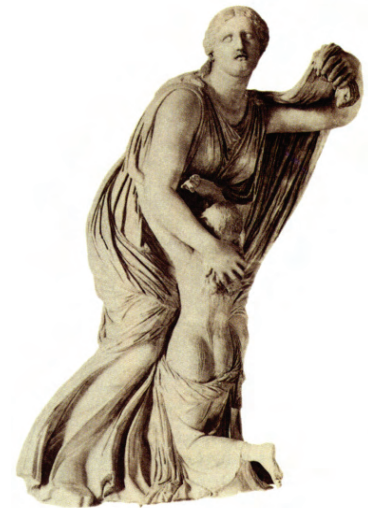
Niobe with daughter