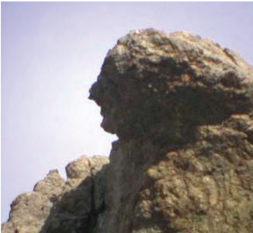
The mountain in Turkey, possibly near Manisa.