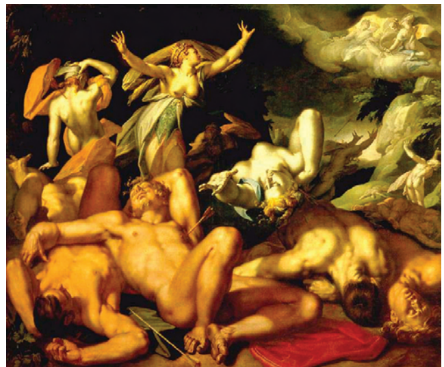
Niobe's dead sons - Raphael Regius Edition, 1509