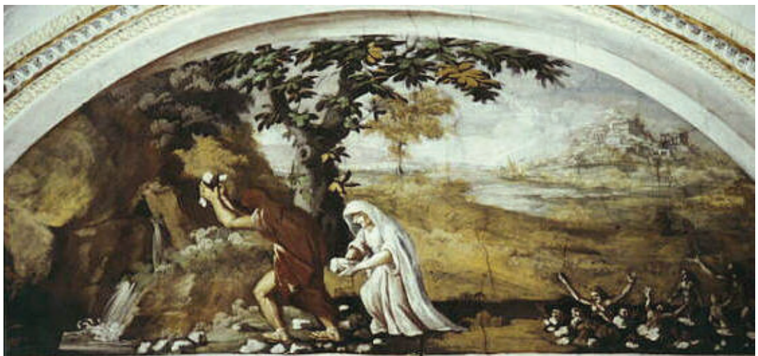
created by Donald Connor